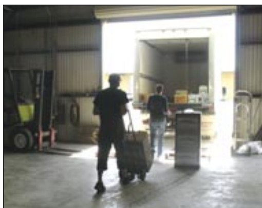
Capay Valley Farm Shop (CVFS), Esparto, Calif., is a direct-to-consumer and wholesale food hub in Central California. It does wholesale business with independent specialty retailers, restaurants and corporate cafeterias. Below: A Greenmarket Co. delivery truck makes its rounds.