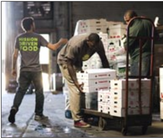
Greenmarket Co., a program of GrowNYC, was launched in 2012. It focuses on the wholesale distribution of locally sourced farm products. Below: The Red Tomato food hub supplies much more than its namesake food, including peaches and other fruits. Located in Plainville, Mass., Red Tomato is a multi-structured nonprofit that partners with farmers and for-profit distributors.