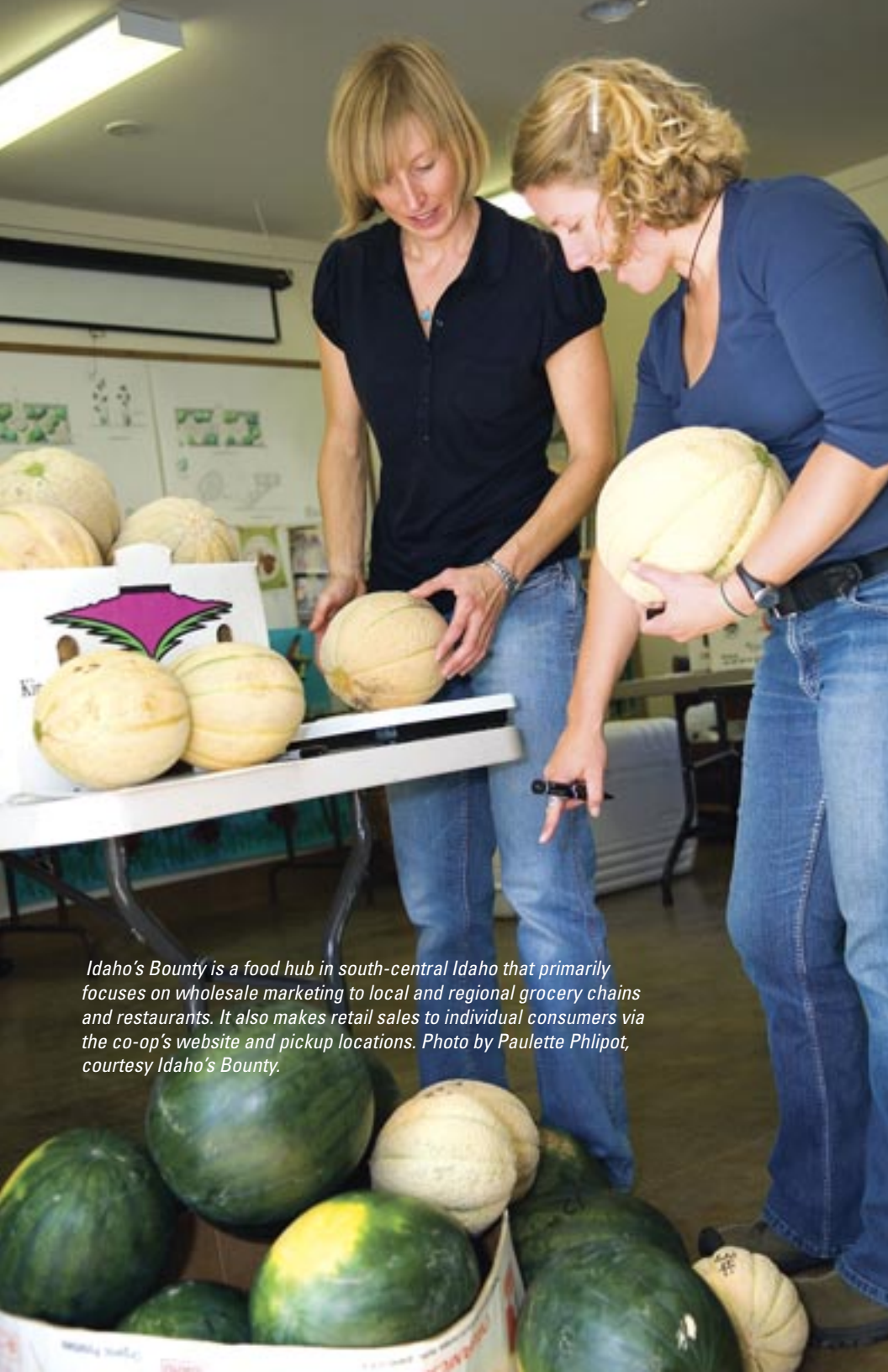
Idaho's Bounty is a food hub in south-central Idaho that primarily focuses on wholesale marketing to local and regional grocery chains and restaurants. It also makes retail sales to individual consumers via the co-op's website and pickup locations.