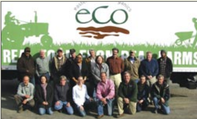
These Eastern Carolina Organics (ECO) farmers are among the food hubs' 50 growers. Farmers own 40 percent of the business and retain 80 percent of total sales.

Lesson Learned: Volunteer labor can be useful, particularly during startup or periods of growth. But long-term success will require regular employees and the continuity of institutional knowledge and the relationships they bring.