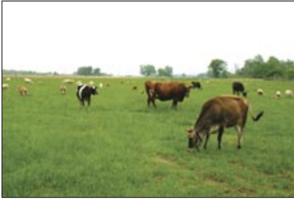
Livestock on pasture that will be processed through a USDA-inspected facility and marketed through This Old Farm (TOF) food hub. Below: Like many of his fellow producer-members in Fifth Season Cooperative (FSC) in Viroqua, Wis., this producer is proud of his deep roots in organic agriculture. Opposite page: This egg producer serves the local market around Charlottesville, Va., through Local Food Hub (LFH).