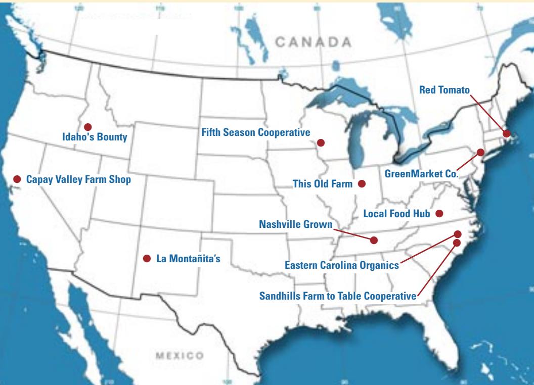
Figure 1 — Location of Participating Food Hubs